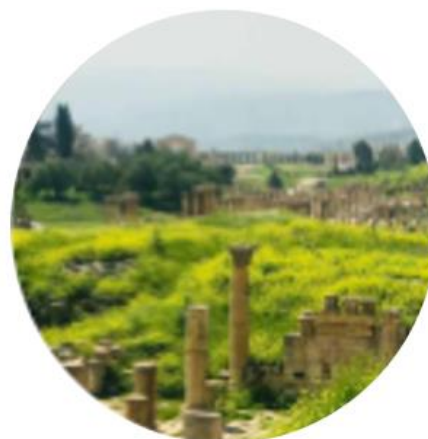
S & M Middle East